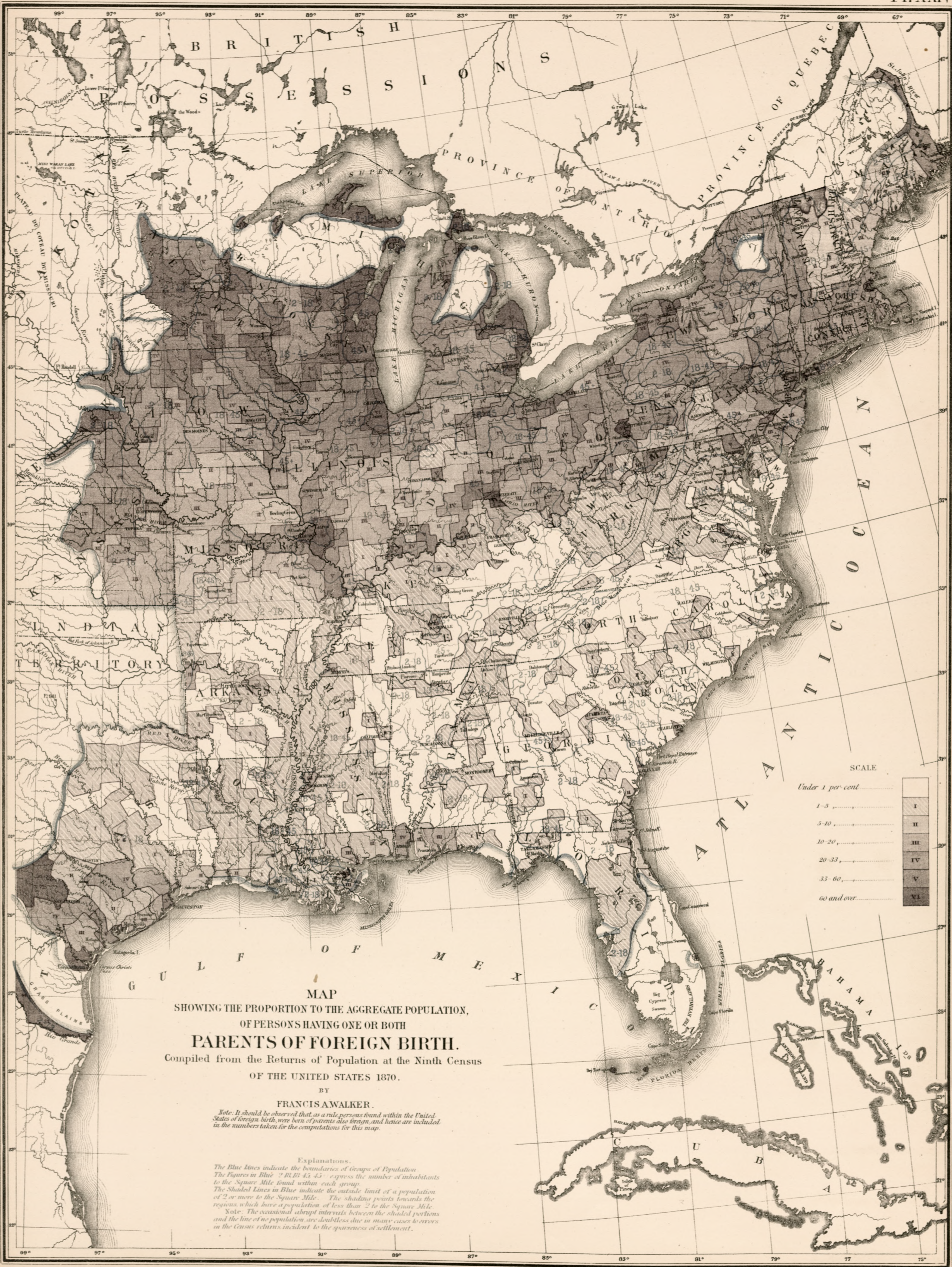
MAP SHOWING THE PROPORTION TO THE AGGREGATE POPULATION, OF PERSONS HAVING ONE OR BOTH PARENTS OF FOREIGN BIRTH. Compiled from the Returns of Population at the Ninth Census OF THE UNITED STATES 1870.

BY FRANCIS A WALKER. Note: It should be observed that, as a rule, persons found within the United States of foreign birth, were born of parents also foreign, and hence are included in the numbers taken for the computations for this map.